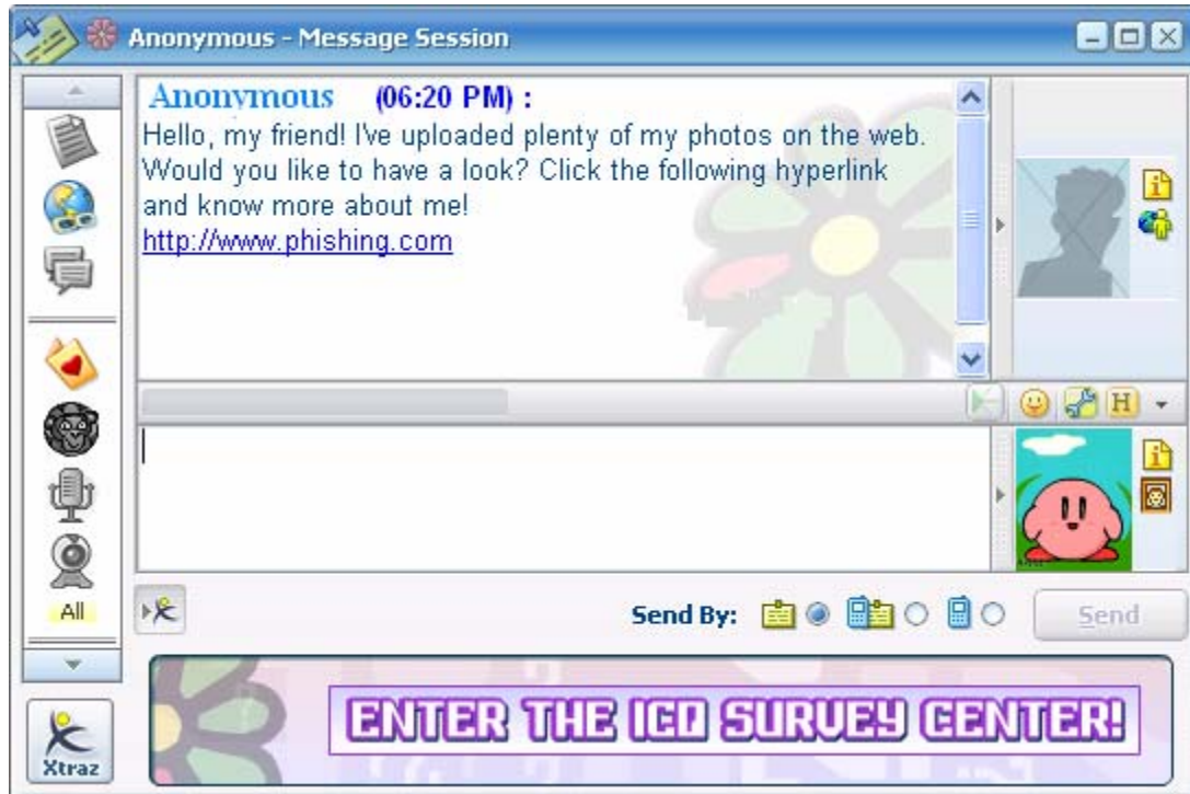
Figure 1. Example of Phishing Message Sent via Instant Messenger

The fourth phishing method is through Web-based delivery. Once a victim enters a Web site by clicking onto the link embedded in an e-mail or message of an instant messenger, malicious programs will be implanted on the computer of the victim that steal his/her private information once they conduct online transactions using the same computer. The transfer of malicious programs from the Web to a computer is difficult unless the user is careless and opens a suspicious file. By making use of pop-ups, frameless windows or zero-sized contaminated graphics it is easy to make the transfer unnoticeable to the user. Phishing channels such as e-mail and instant messenger are the most popular and they account for 90 percent of the phishing attacks. Malicious programs and Web-based malicious program delivery lead to 10 percent of phishing attacks. In December 2005, APWG recorded 180 cases of password stealing malicious code (unique applications) and 1912 password stealing malicious code URLs [APWG 2006].